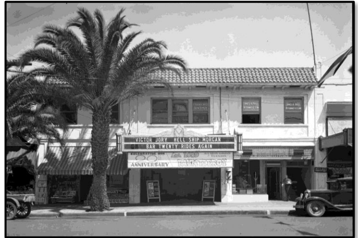
HEMET THEATRE, 1936

On Monday October 11 th at 7 pm, the Hemet Heritage Foundation will host a Birthday Party for the vintage movie house. The free event will feature a presentation on the history of the landmark building and memories from former employees and patrons from decades past. Audience members will have an opportunity to share their own stories.