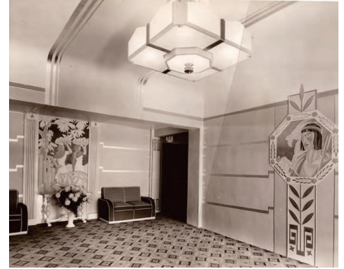
lobby circa 1940